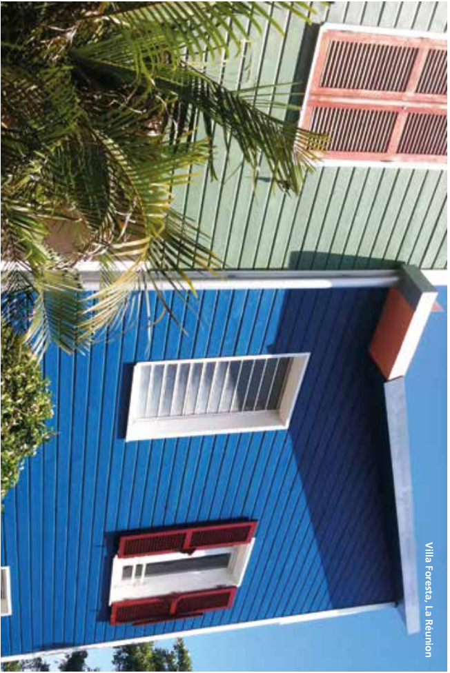
Villa Foresta, La Réunion