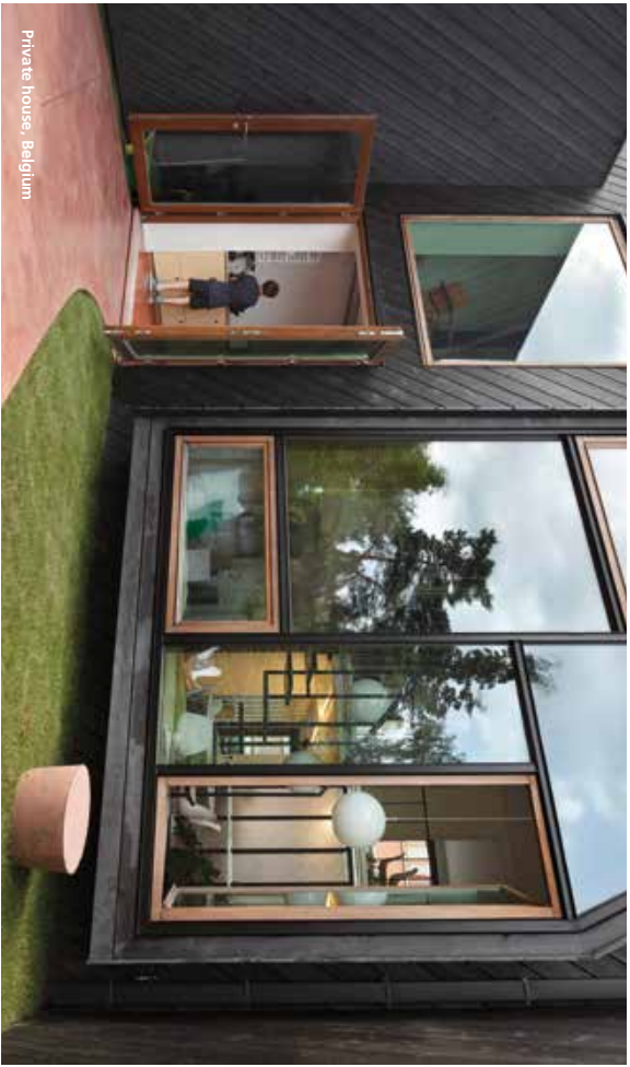
Private house, Belgium